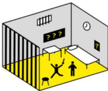
Room Style Game

A mobile – pop-up – portable – mini escape game is an activity that takes place in a small space for a small audience and takes no longer than 20 minutes.